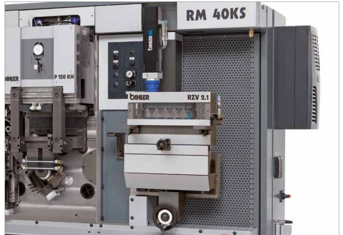
RZV 2.1 with device for horizontal and vertical axis adjustment and protection against contact

Easy programming and convenient operation with machine and process controller VariControl